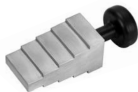
Aluminium Safety Block CY15B as option.