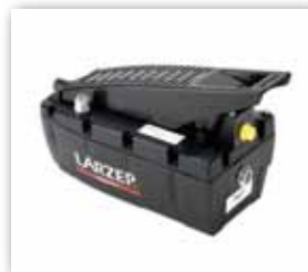
Air Hydraulic Pumps, Z, ZR.