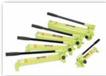
Single Acting Hand Pumps, W.